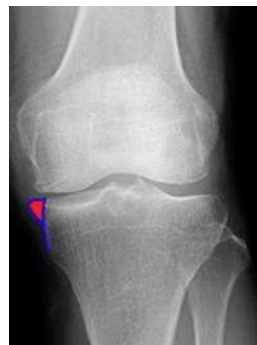
Figure 3. Osteophyte Area/OPA (red area)