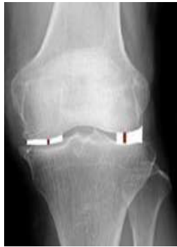
Figure 2. Minimum Joint Space Width / mJSW (red line)