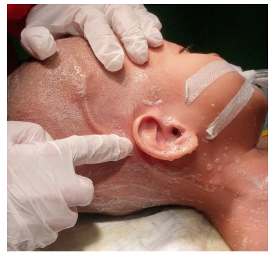
Figure 3. Palpation of the tract shunt area