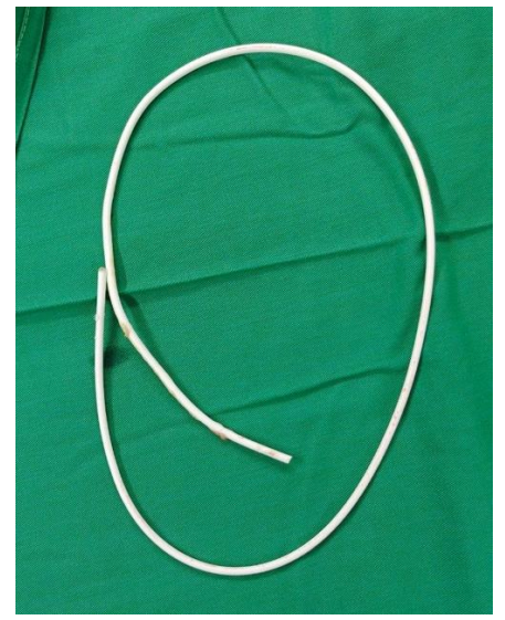
Figure 8. Retained Peritoneal shunt