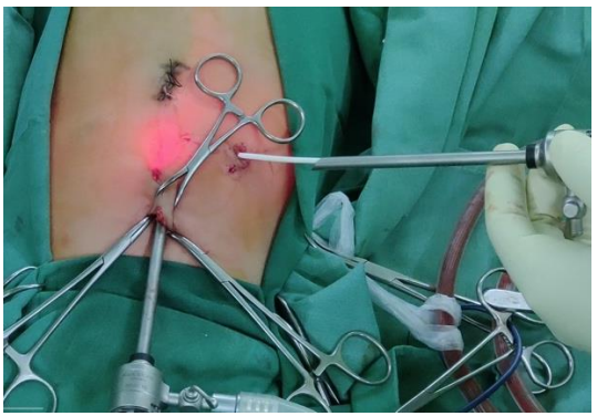
Figure 7. Peritoneal shunt extraction using laparoscopy