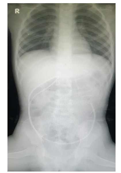
Figure 4. A plain photo of the abdomen shows both ends of the VP Shunt catheter within the abdominal area