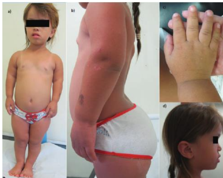
Figure 2. Achondroplasia patient profile : (a) short limb, big sized head (b), kyphosis and lordosis (c), trident hand, short fingers (d), protruding forehead (Ceroni et al , 2018).

Radiological examination is important for diagnostic confirmation, such as infantogram in infants that is seen in picture 3 (Bhusal et al , 2020). Hip joint and femur radiological image look typical: horizontal acetabulum, narrow sacral bone notch, the proximal part of the femur looks darker, short,