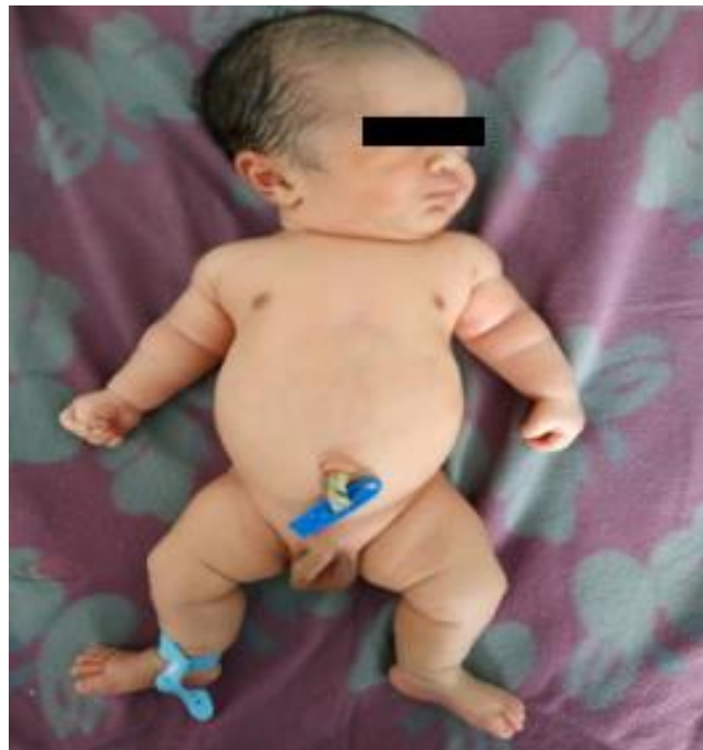
Figure 1. Clinical feature of achondroplasia in the newborn (Bhusal et al , 2020).

knee joint (genu varum), and decreased muscle tone. Not all the symptoms can be seen in babies or children with achondroplasia (Pauli, 2019).