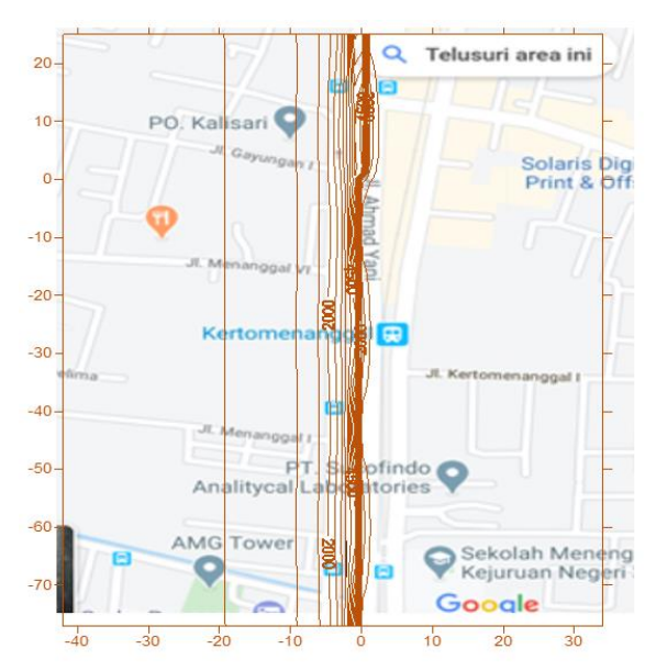
Figure 3. Location where case study was being investigated at frontage road Ahmad Yani Surabaya City Indonesia

Plotting simulation for CO dispersion is shown in Figure 3. It showed that along the frontage road, the average concentration of CO was around 4500 ppm and the minimum concentration was around 2000 ppm. It means that dispersion model predictions of CO at frontage road were small, as has been observed in other analyses.